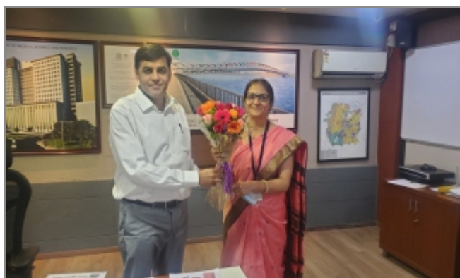
Sh. Lochan Sehra, Municipal Commissioner, Ahmedabad.