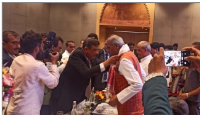
Mr. Jagdambika Pal, MP, Chairman of the Standing Committee of Parliament for Housing & Urban Affairs being felicitated