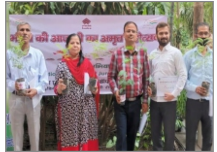
मुख्यालय का वृक्षारोपण अभियान