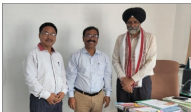
Shri Amar Deep S. Bhatia, Development Commissioner, Planning & Coordination Department cum Commissioner to Hon'ble Chief Minister