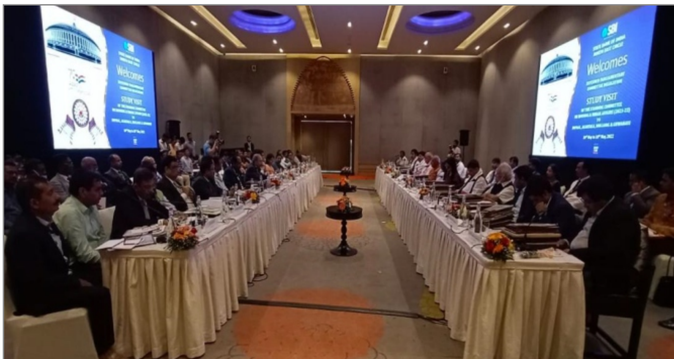
Meeting of the Standing Committee of Parliament