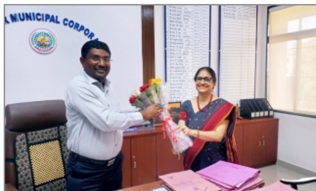
Sh. Yogesh B Nirgude, Municipal Commissioner (I/C), Bhavnagar