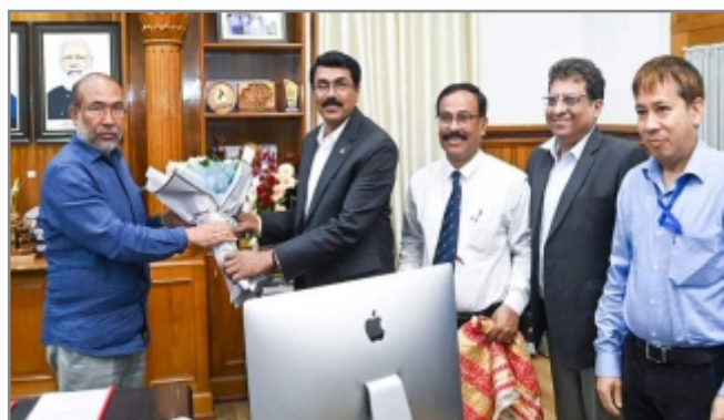
Shri N. Biren Singh, Hon'ble Chief Minister of Manipur