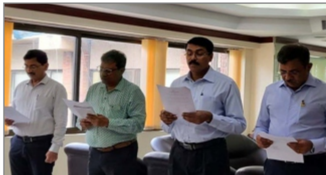
Pledge Ceremony in Corporate Office

The day is observed for promoting public awareness of the need for voluntary unpaid blood donation and to sensitize the country men on the need for committed, year-round blood donation, to maintain adequate supplies and timely access to safe blood transfusion.